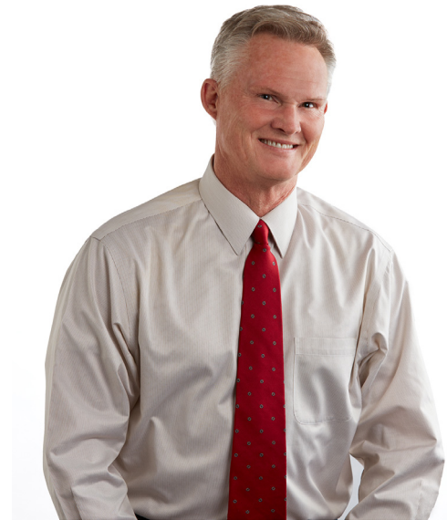
Mayor Tom Westmoreland