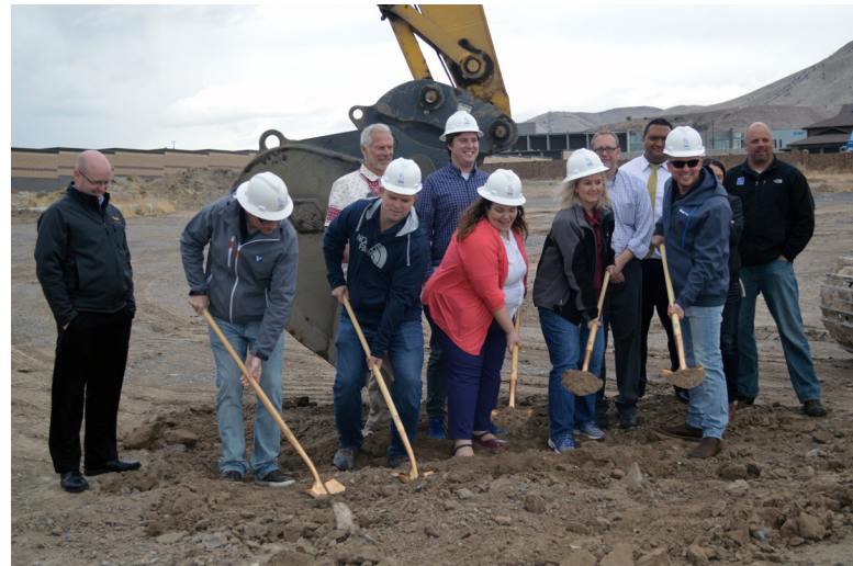
City officials, staff, and business partners participated in a groundbreaking event for the new Gateway Park Business Center off of Mt. Airey Dr., north of Wride Highway (SR-73).

Funds for the City's contribution to the first phase of the recreation center will be included in the proposed budget for the 2018-2019 fiscal year, which is submitted to the city council for approval in June and begins in July 2018. If the funds are approved in the budget, plans for construction will move forward. We do not have a construction timeline at this point but the facility would be located in the Porter's Crossing Town Center. Residents should not expect a large scale rec center like the Legacy Center at the outset but with this