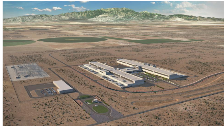
A rendering of the Facebook data center in Eagle Mountain

One of the first things that the City needed to do was sell our utility company. This was a bit of a gamble because we had to give up something we had in order to get something we wanted and there was no way of knowing at the time exactly how all of that would work out. Because of those uncertainties not everyone agreed that it was the best course to take. We can clearly see now that