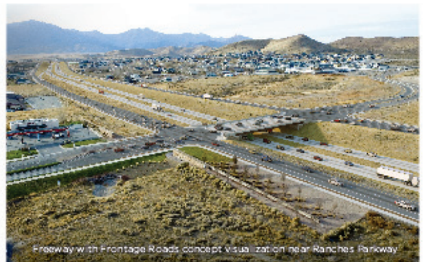
Freeway with Frontage Roads concept visualization near Ranches Parkway

Please visit the project website at udot.utah.gov/sr73 or come to the public hearing to review the Draft SES, see maps of the refined freeway with frontage roads alignment and learn more about the results of the study.