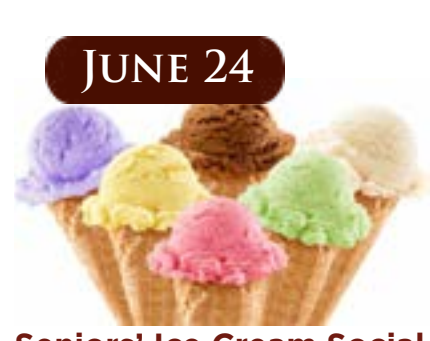
Seniors' Ice Cream Social

Work session: 4 p.m. Policy Session: 7 p.m. Agenda and supporting documents typically posted on the City website the Thursday prior.