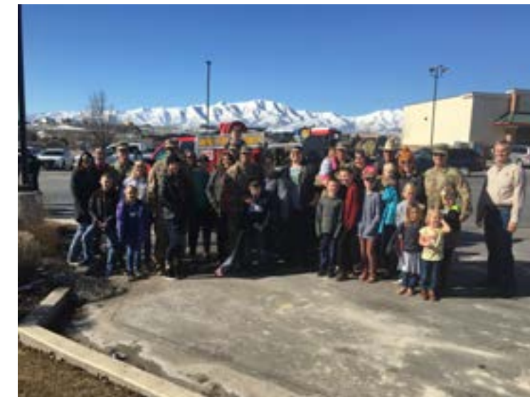
Yellow ribbon kids