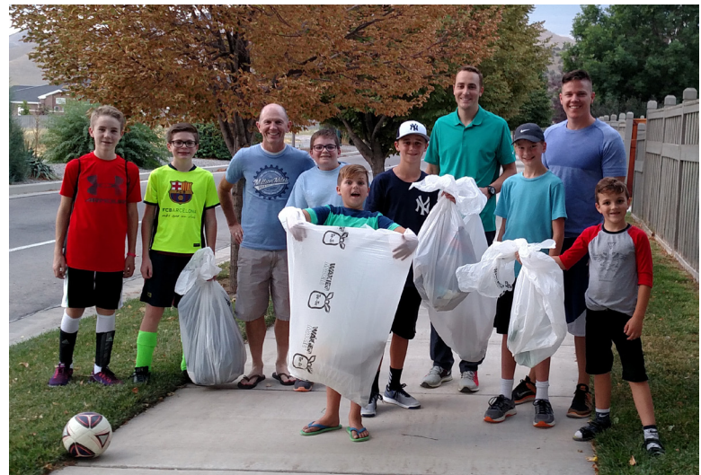
Members and leaders of Boy Scout Troop 1229 were “caught” doing good in the community, picking up trash. Thanks guys!

For myself, with family living in Las Vegas and having grown up in the south, the horrific Vegas shooting and destructive hurricanes are unfortunate reminders of how critical early responders and volunteers are during these types of events.