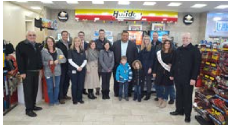
A ribbon cutting was held on December 5 to celebrate the opening of the Holiday Oil/Chevron at Pony Express Pkwy and Eagle Mountain Blvd in City Center. Eagle Mountain City is happy to welcome commercial growth in this area of the city.

The cost to build the school is currently estimated to be between $70 million and $73 million and the facility is expected to be 344,000 square feet. As ASD builds their schools, they have a process of tracking what they learn from each design and making improvements to future projects. It is my understanding that lessons learned from the Skyridge HS will be incorporated into this build.