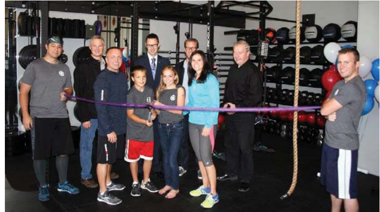
One of EM's newest businesses, CrossFit 1976, held a grand opening event last month, celebrating their location at 3535 Ranches Pkwy (next to Great Clips).

UDOT is aware of our concerns over the weather and the potential for accidents. We will continue to monitor this closely. Any construction that may be done to make changes