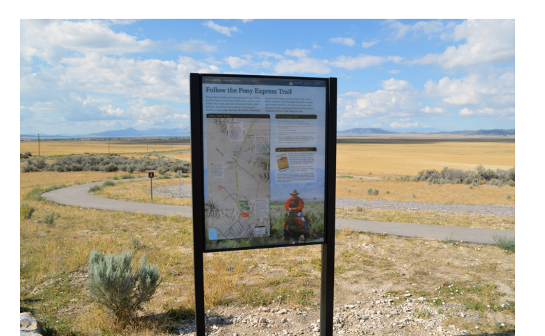
For information on the new educational signage along the Pony Express Trail, please visit the City website, News section.

I enjoy our western heritage. There is a romantic element to the Wild West, and Eagle Mountain's history is tied to it. I