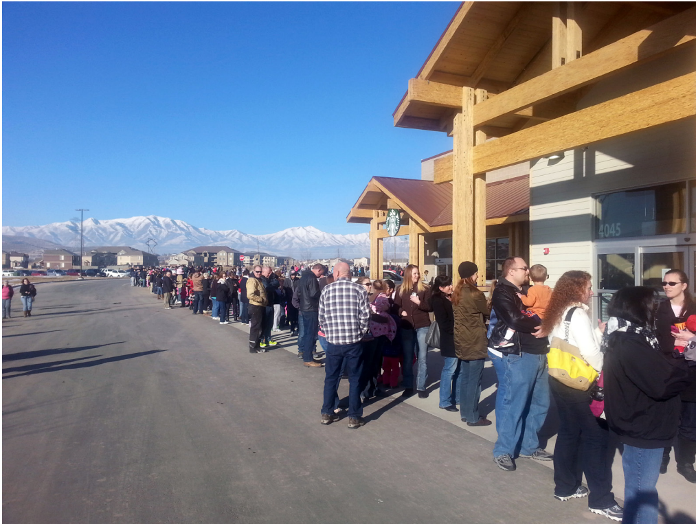
A line of future shoppers awaited the opening of Eagle Mountain's first full-service grocery store, Ridley's Market, on January 21. The first 200 customers were given a free bag of groceries.