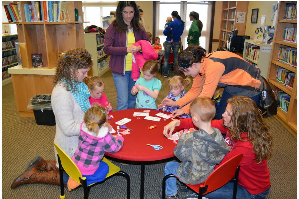
Children make a Valentine craft after storytime at the library.