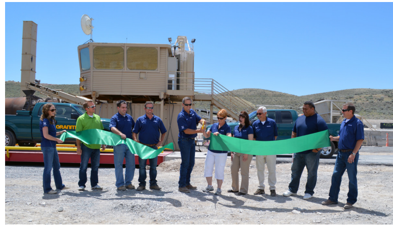
A ribbon-cutting and community open house was held on June 15 at Granite Construction's new asphalt facility in Eagle Mountain.

Some residents are concerned that Granite may not live up to the agreement and shut down operations and move somewhere else. They chose to locate in Eagle Mountain because it makes good business sense for them. Eagle Mountain, Lehi, and Saratoga Springs are picking up again with building and growth. This means a lot of work for an asphalt company, and close proximity to the work allows you to deliver your product at a lower cost than your