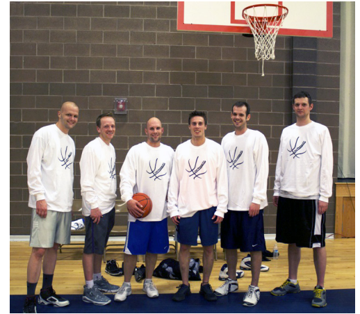
The first season of the City's men's basketball league was a success, with eight teams registered. First place victors were Urine Trouble (pictured left). Second place went to Victorious Secret (right). Registration for next season will open in late fall, with games January-March.