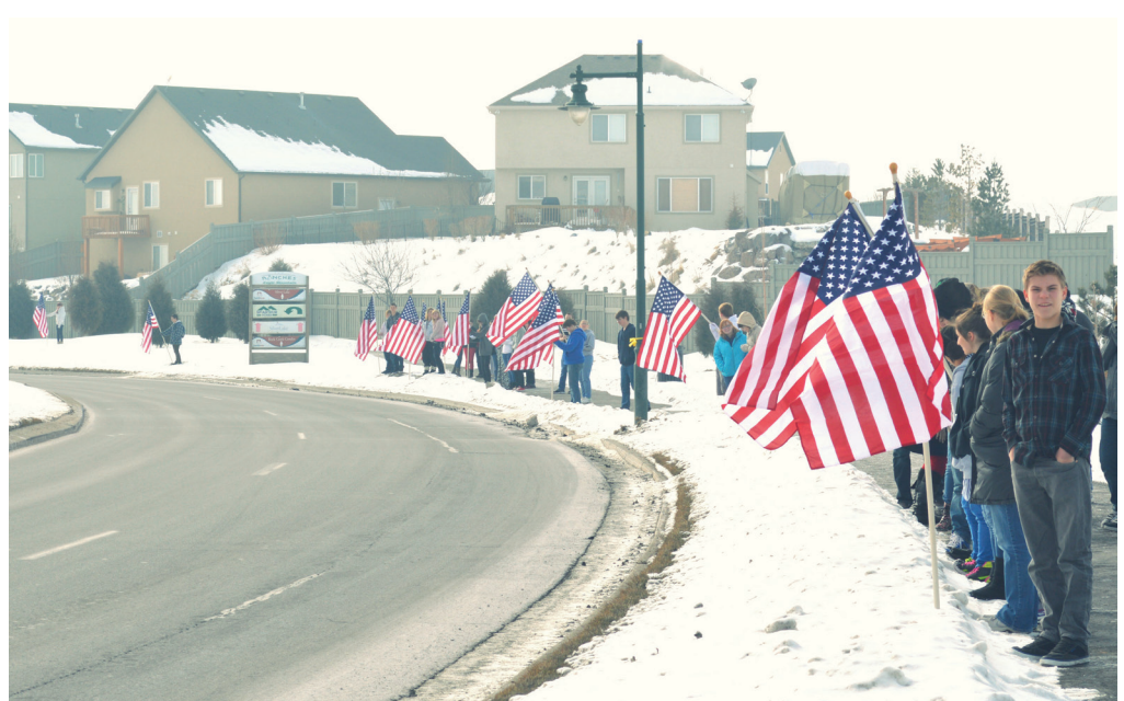
Students from Rockwell Charter High School helped hold flags at the start of the military welcome home procession.

Call 801-226-5111 to make an appointment.