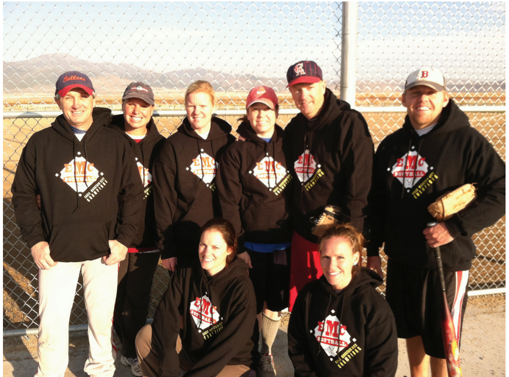
The City's first season of the adult co-ed softball program was a success, with 14 teams participating. First place winners, "Hillbillies," are pictured above wearing their championship hoodies. Second place went to "Turn Key Real Estate."

Watch for info in the next newsletter about changes to hours, due dates, and fees coming soon.