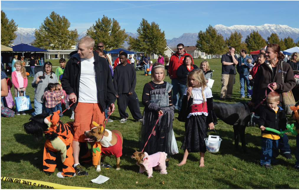
Canine friends "Tigger", "Pooh", and "Piglet" got into the Halloween spirit at the City's second annual Trick or Treat Village event at Nolan Park.