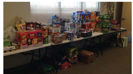
One of many areas in fire station #2 in The Ranches filled with donations from the community during the Dump Fire. THANK YOU to all those who provided food and water for the firefighters and to the volunteers who helped organize and deliver it.

We are in need of more respondents for Eagle Mountain City's annual citizen satisfaction survey, available now through July 31. The survey takes approximately 10 minutes to complete. The information we receive from our residents guides our planning and priorities, so we appreciate you taking the time to respond. It is located on the City website, News section.