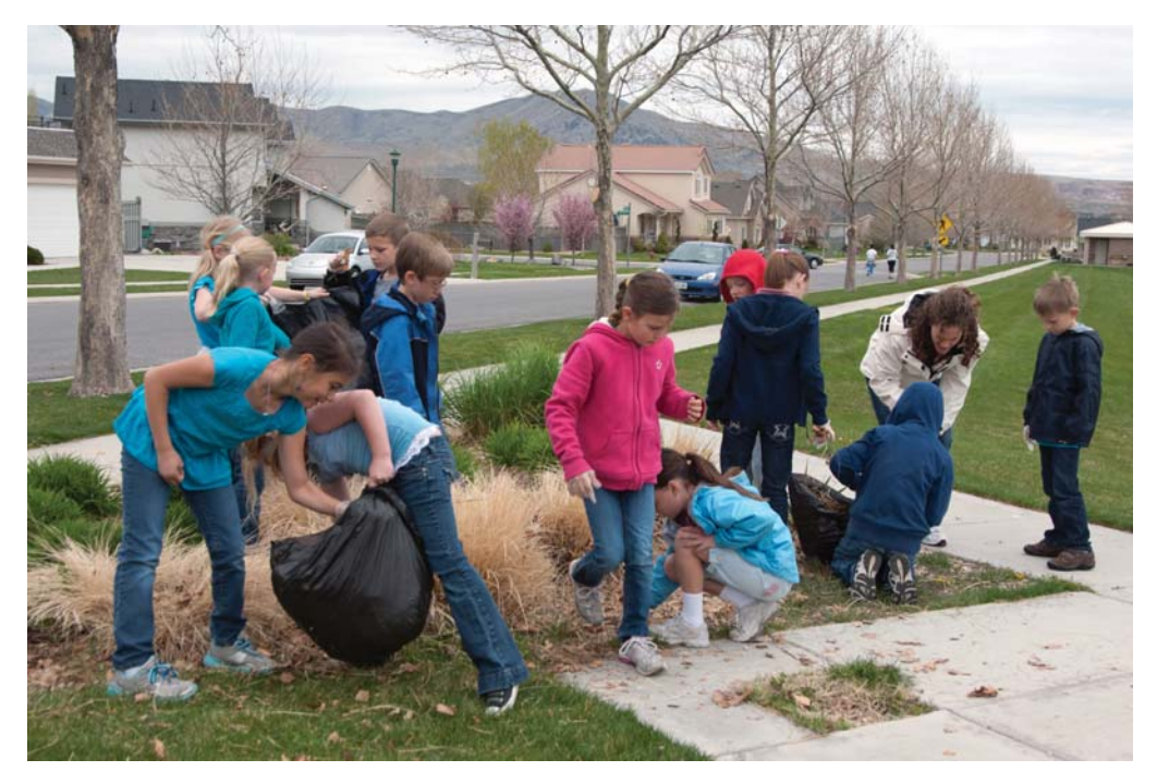
Second graders from The Ranches Academy help clean up Nolan Park in honor of Earth Day last month.