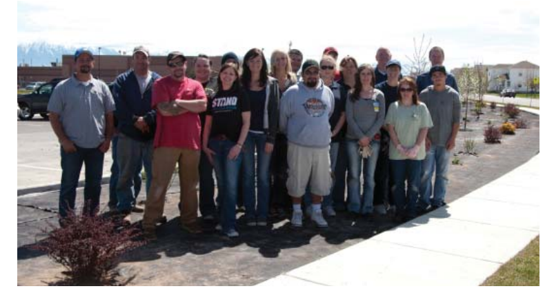
Volunteers from the Saratoga Springs Walmart and other Utah Co. Walmart stores helped members of the City's public works department plant shrubs bordering the parking lot at Smith Ranch Park in honor of Earth Day.

Right now we have a location disadvantage to Saratoga Springs with respect to retail businesses because most people in the area drive through Saratoga Springs to get to our city. We believe as we continue to increase the presence of non-retail businesses that provide jobs in Eagle Mountain, that additional retail will eventually