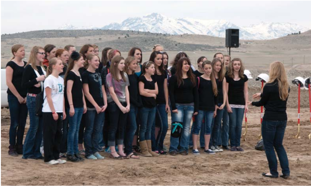
The Vista Heights Middle School choir performs at the groundbreaking ceremony for Eagle Mountain's new middle school.