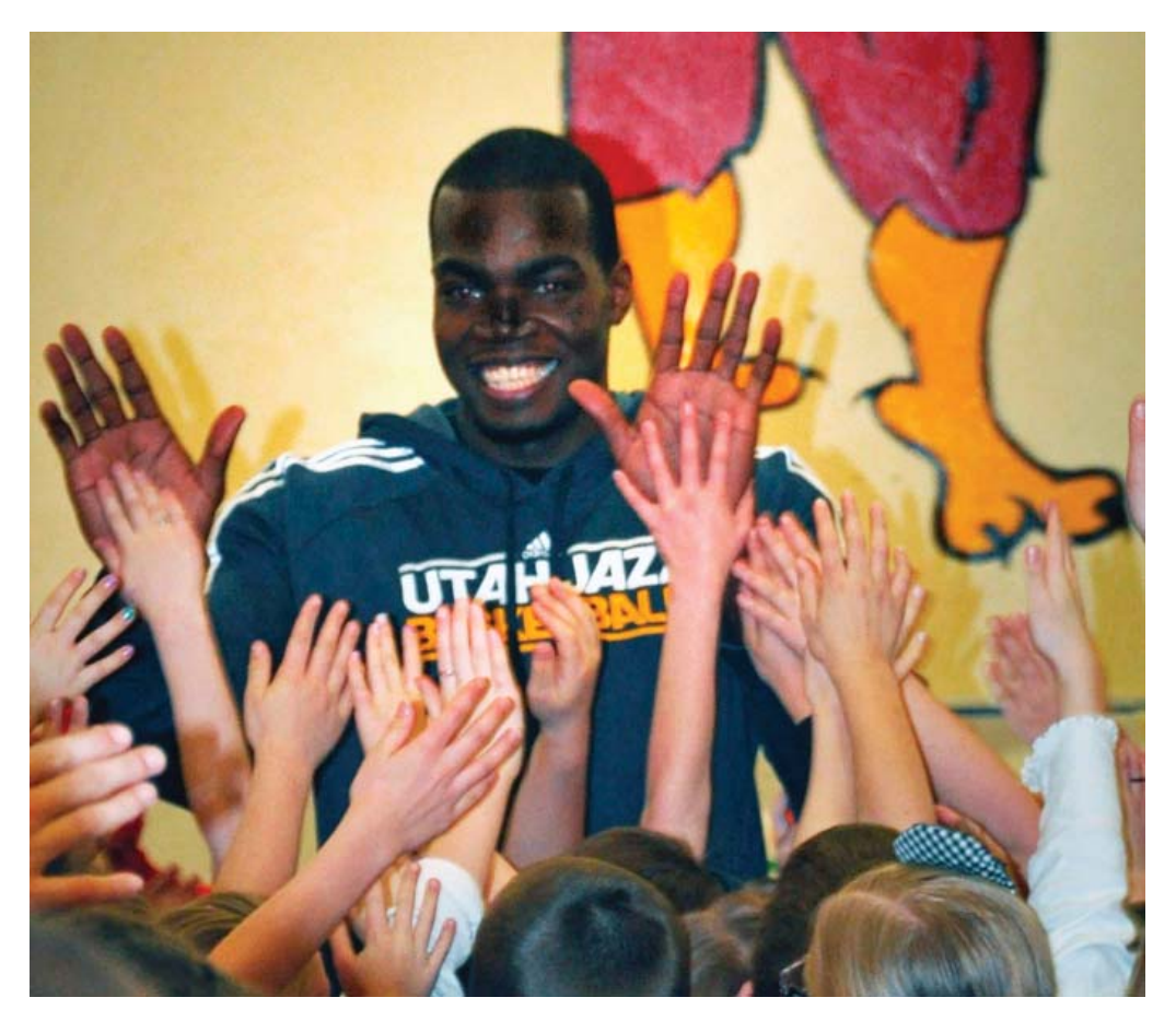
Paul Millsap of the Utah Jazz high fives a throng of students at The Ranches Academy.