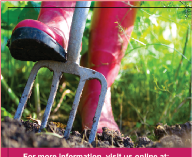
For more information, visit us online at: www.centralutahgardens.org