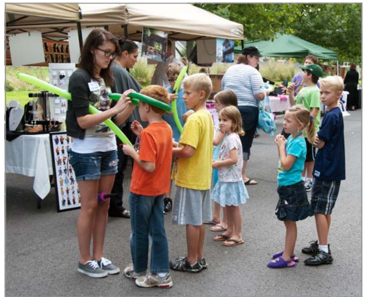
Children gather during the fall street fair, waiting to be fitted for balloon hats. Over 40 vendors participated in the fair.

There will also be appearances by Santa and Mrs. Claus, December 13, 15, 17, 20, 21 from 6:30 – 9:00 p.m.