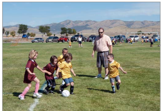
The City concluded another season of Youth Soccer. There were 955 players this year. Thanks to the coaches, team parents, players, and staff who made it successful!