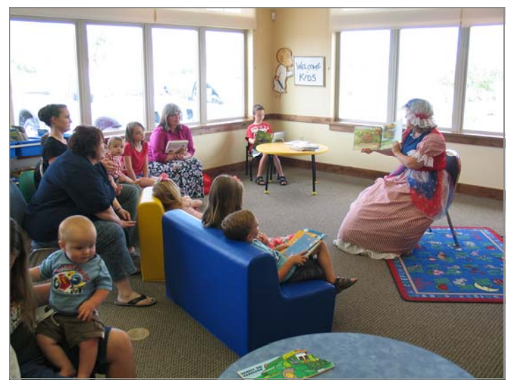
Volunteers from Alpine School District visited the library for story time.