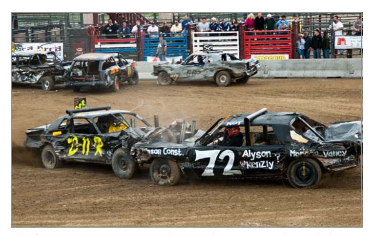
The first Pony Express Days Demolition Derby was very well attended, with some proceeds going to Westlake High Football.

Register on icount.com to make your voice heard. This is a free service. The City will use poll results in our planning.