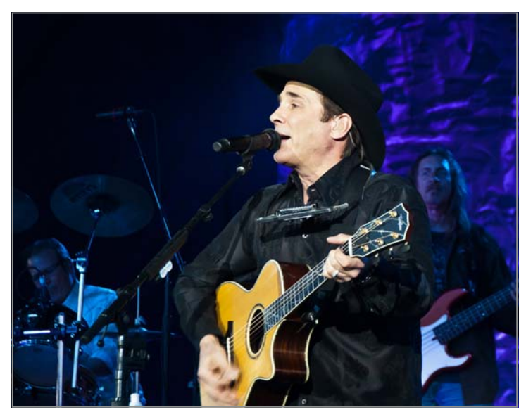
Country music superstar Clint Black closed out Pony Express Days 2011 with a concert and fireworks display at SilverLake Amphitheater. Black entertained the large crowd with many of his classic hits.