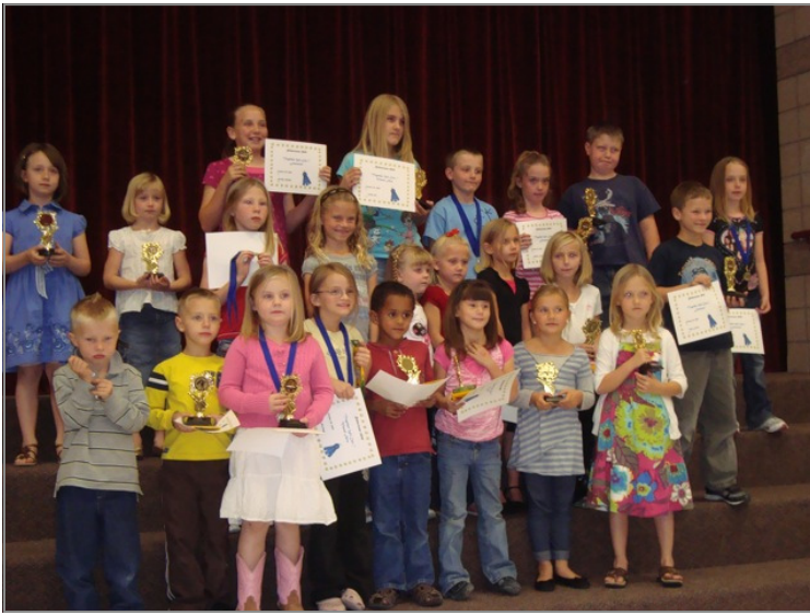
Students at Mountain Trails Elementary who participated in the annual Reflections contest pose with their awards. The Reflections contest allows students to submit entries in the categories of dance choreography, film production, literature, musical composition, visual arts, and photography.