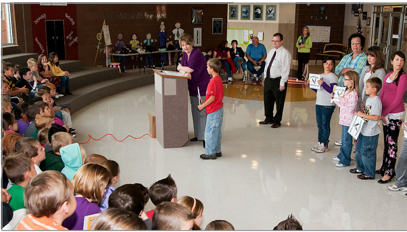
Third grade students of the month were recognized at an assembly at Eagle Valley Elementary in October.