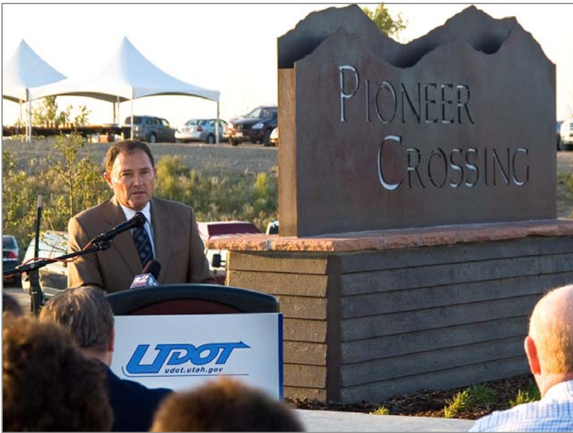
Governor Gary Herbert spoke at the opening of Pioneer Crossing on August 23. The new east-west connector from Redwood Road in Saratoga Springs to I-15 has lessened the traffic on Lehi's Main Street, which was seeing approximately 30,000 vehicles travel each way daily.