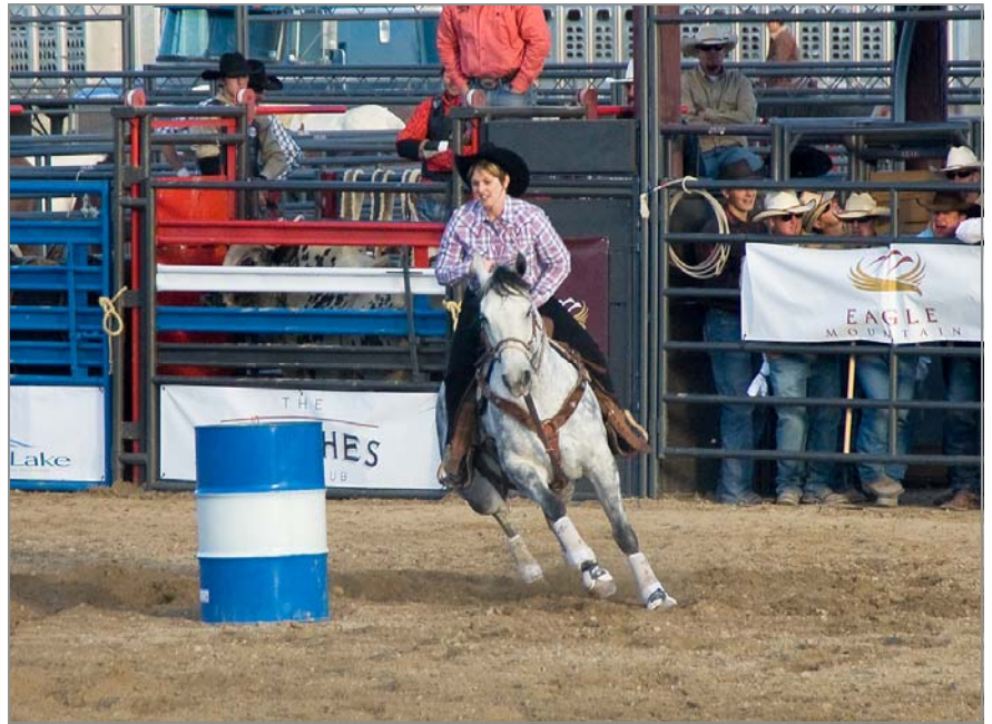
Mayor Jackson's Race for Our Heroes fundraiser at the Pony Express Days PRCA Rodeo raised $2,000 for families fighting cancer. For information on other money raised for charities during Pony Express Days, see pg. 5.

Lastly, please thank the members of the Transportation Commission, Senator Valentine, and Mayors Washburn and Curtis of Orem and Provo. They have been instrumental in helping me to obtain some funding for the widening of SR-73. On Wednesday, June 23, the transportation commission voted to approve a scaled back project that will widen SR-73 to a four lane road from 800 West in Saratoga Springs to Ranches Parkway in Eagle Mountain. This road will not have all of the bells and whistles that were originally promised. However, I feel that concerns about safety and traffic flow have