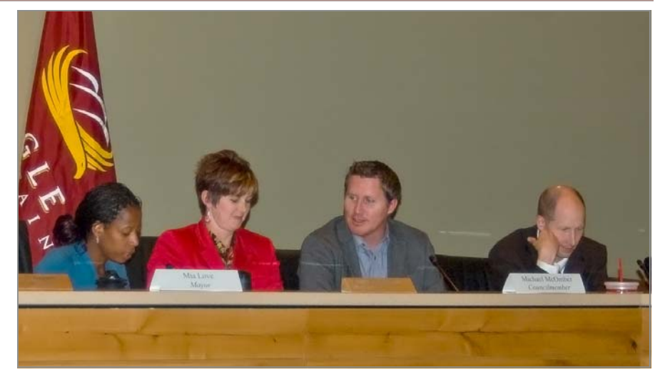
A joint city council meeting with Saratoga Springs was held on May 18. Items discussed included a proposal for a Westlake fire district, to include Eagle Mountain, Saratoga Springs, Cedar Fort, Fairfield, and Goshen.

The council also implemented a new tiered water rate schedule. This is intended to help with conservation. There were many challenges with this process as conservation on a ¼ acre lot is different than conservation on a 1 acre lot. See the following table: We are offering both a small lot tier and a large lot tier. Your property must be ½ acre or larger to qualify for the large lot rate. Each home will be placed in the small lot tier to begin with. You will need to fill out an application for the large lot tier. The application will be online as well as in the utility office. We will verify your lot size and then place you on the large lot rate. We will not be charging any additional fees for this change and you can apply at any time. We will not however, make this retroactive. It will apply as soon as we receive your application. The new water rates will be implemented as of July 1.