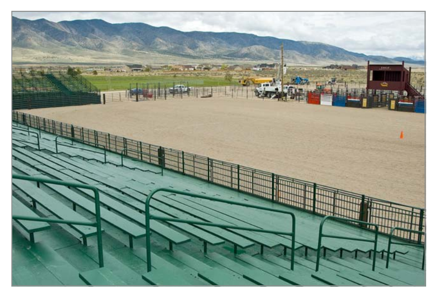
The Pony Express PRCA Rodeo arena is located at Pony Express Memorial Park in City Center (4447 Major Street), near the skate park.