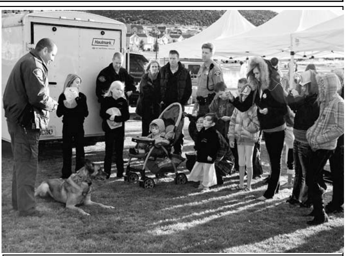
Attendees at the Public Safety Fair listen to a presentation about K-9 training.