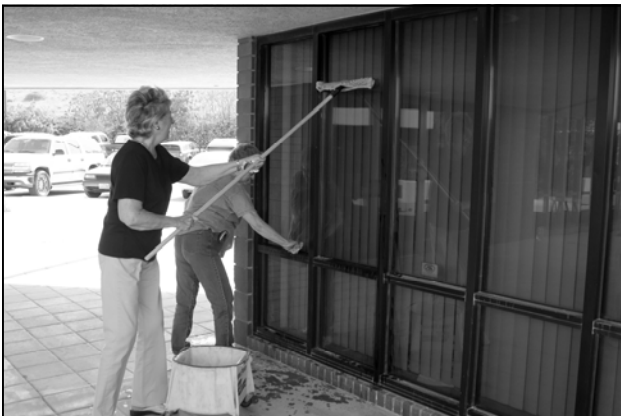
Eagle Mountain's seniors had a strong showing at the City's volunteer work day at the Utah Veterans Memorial Park.