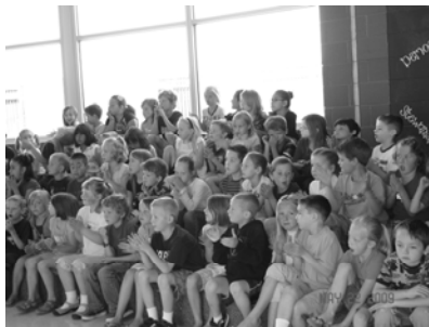
Eagle Valley Elementary's First Grade classes held a Jump-a-thon to raise funds for the library. They were able to raise $812.95 for new books for the library!