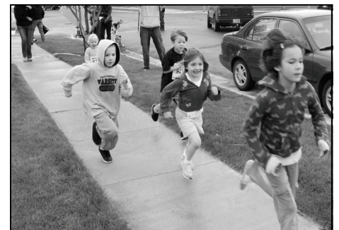
Kid's 1K Fun Run

The 5K race and kids 1K family fun are a great way to start a full day of fun at Pony Express Days.