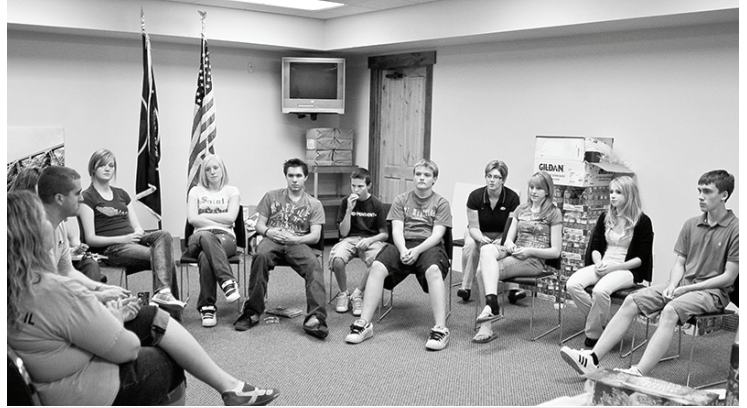
Many city boards and commissions were formed or revived, including the youth council (pictured above), economic development board, parks and recreation board, and the cemetery board. The senior citizens council continued to see their numbers grow.