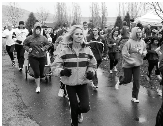
Substantial additions to our parks and recreation facilities were made in 2008 with the construction and opening of Pony Express Skate Park (pictured left), and the Pony Express/Sweetwater Trail. The 4.2 mile trail (one-way) provided a venue for a new city event, the Turkey Trot/Walk on Thanksgiving Day (pictured right). Also completed was the first phase of Mid-Valley Regional Park, which will provide additional playing fields for the soccer and football seasons this year.