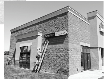
The number of new businesses in the city continued to grow. As of December 2008 there were 260 active registered businesses in Eagle Mountain.