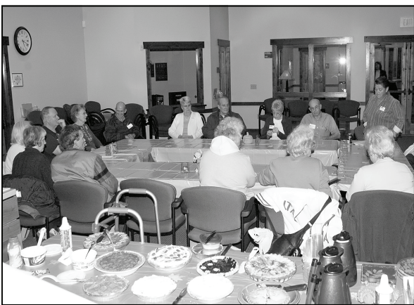
The seniors gathered and shared their favorite pies and Thanksgiving memories at their monthly activity in November.

Holiday Closures — The library, along with the rest of the city offices, will be closed on Monday, January 19 for the Martin Luther King, Jr. holiday and Monday, February 16 for the President's Day holiday.