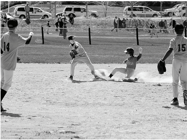
Sports programs continued to be popular with the youth. The city added an adult men's basketball program and a girls fast-pitch softball league in 2008.