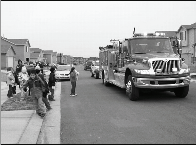
Children eagerly awaited the arrival of Santa on the fire truck as he visited Eagle Mountain neighborhoods on December 13.