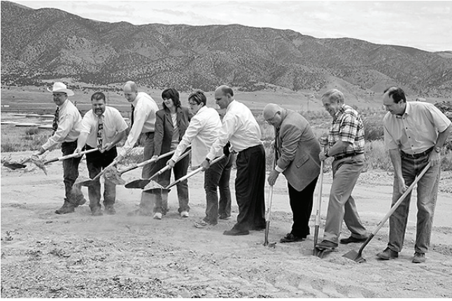
The city held groundbreaking ceremonies for several significant construction projects, including the new wastewater treatment facility (pictured above), the Ranches fire station expansion, and Pony Express Skate Park.