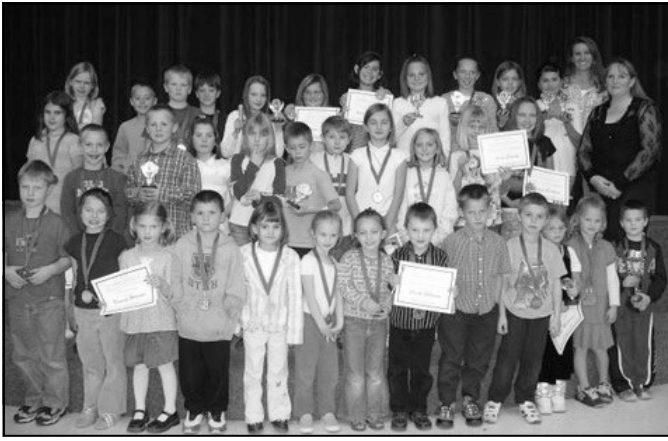
Eagle Valley Elementary students who participated in this year's Reflections contest responded to the theme "I Can Make a Difference By..."