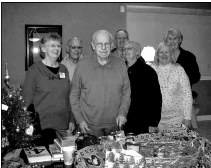
Some of the city's seniors shared their Christmas spirit with a homebound neighbor on December 14.