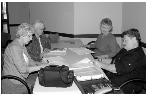
The city's first senior citizens' council met in April.