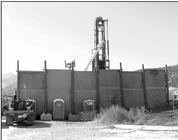
The city drilled two new wells this year.