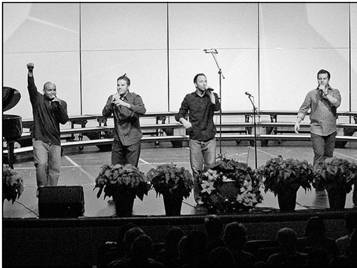
Jericho Road performed at the Home For a Hero: A Night of Thanksgiving concert at Willowcreek Middle School on November 14.