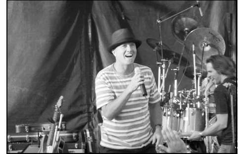
Sawyer Brown's Mark Miller