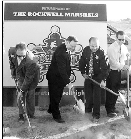
A groundbreaking ceremony for the new Rockwell Charter High School was held in September.