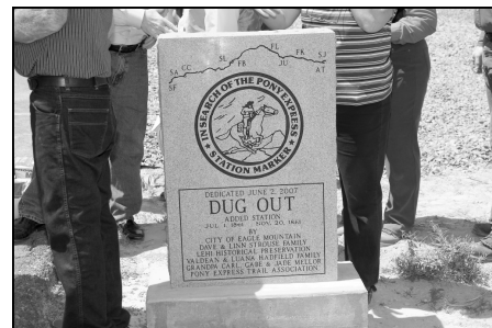
The Pony Express monument ceremony was held during Pony Express Days in June.