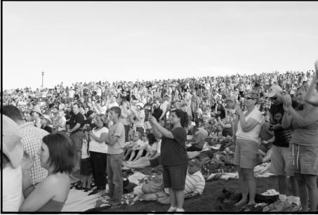
The Sawyer Brown concert brought the biggest crowd in the venue's history.