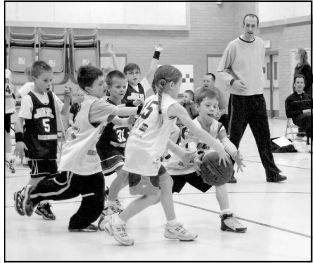
Registrations for youth sports, including Jr. Jazz, increased this year.