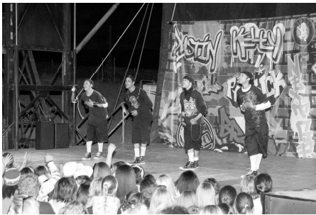
B5 thrilled the crowd in the city's first partnership with Radio Disney.