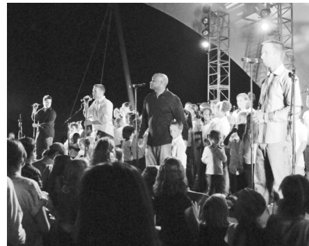
Jericho Road held their second annual benefit concert.