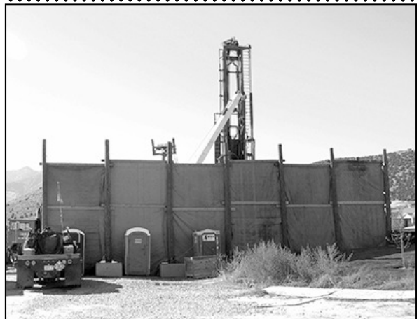
Drilling is underway on the city’s well #4 in the Kiowa Valley area (see news notes pg. 3).

October 25 , 6 PM, Spanish Fork Public Library, 49 S. Main