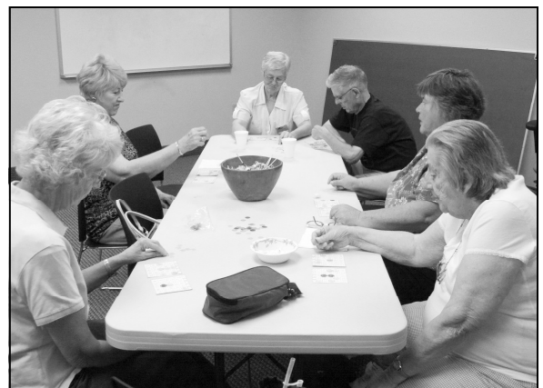
The Eagle Mountain Senior Citizens Council hosted their first BINGO social on August 15.