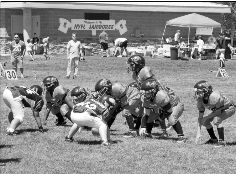
The inaugural weekend of National Youth Football League games in Eagle Mountain was August 10-11. Local teams faced off against teams from the NYFL's headquarters in Las Vegas.

Former NFL quarterback Randall Cunningham (below) was here to cheer on his son who plays on one of the Las Vegas teams.