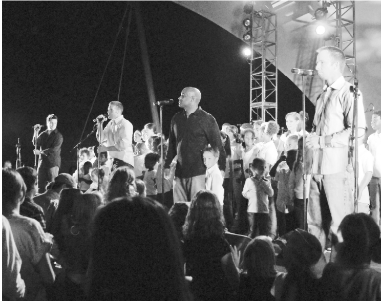
Jericho Road and Genesis Children's Choir perform at SilverLake Amphitheater August 25 in a concert benefiting Reach the Children.