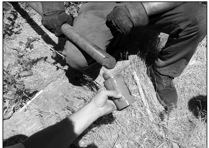
The break in the shaft was located at 535 feet deep.