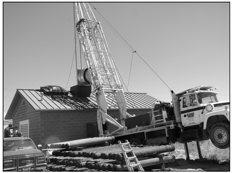
An outside view of the removal process.