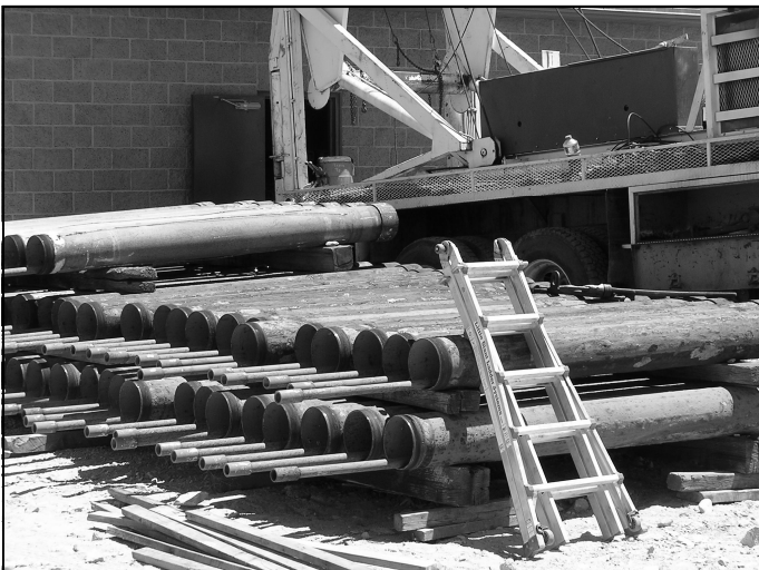
The pile of casing and shaft sections grew during the removal process.