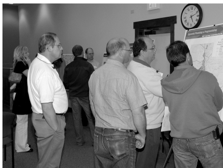
Attendees at a UDOT open house held at Eagle Mountain's City Hall listen to proposed plans for our region.