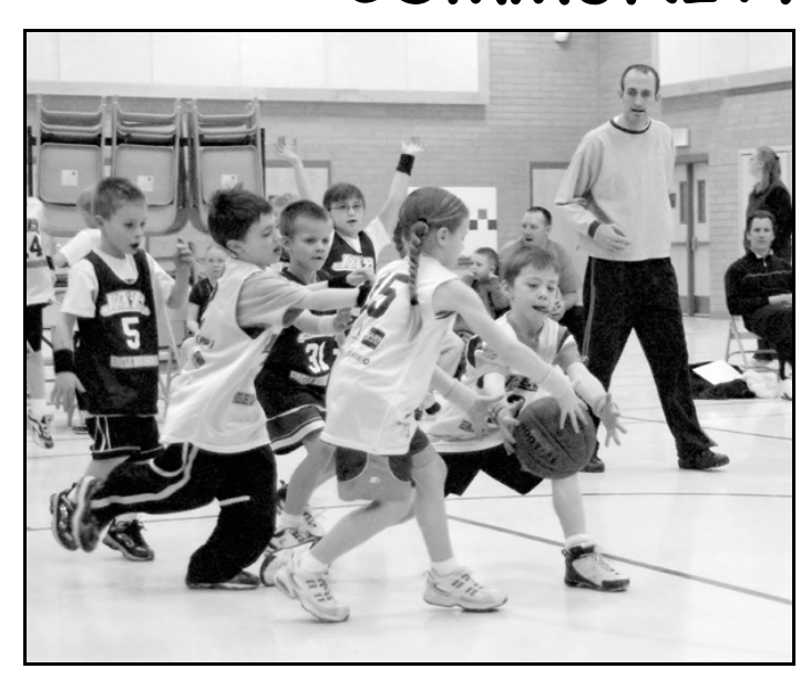
Team members on The Defenders race for a rebound in a game versus The Jazz on January 27. Junior Jazz games continue through March 3.