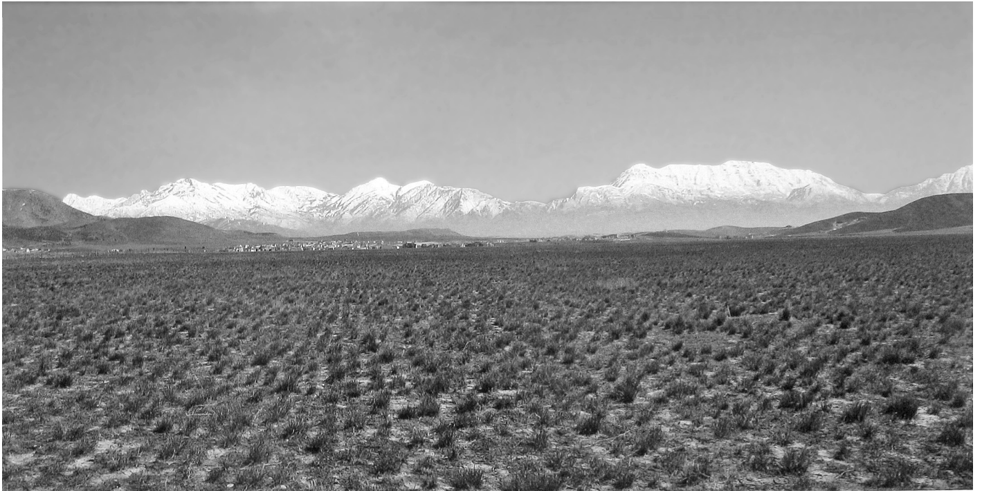
Eagle Mountain's wide open spaces have changed during the past 10 years, but the beauty remains.