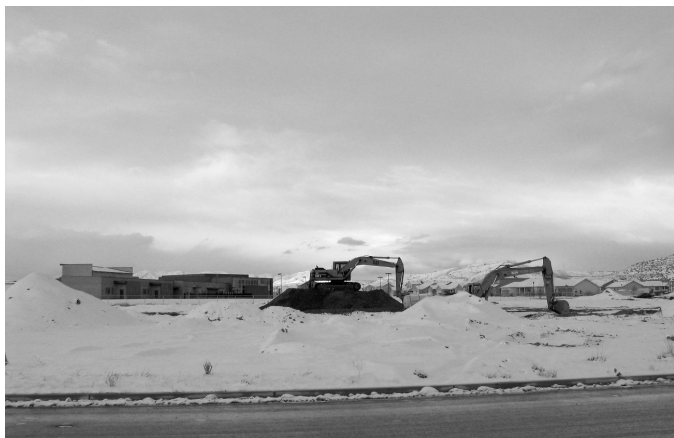
A blanket of fresh snow covers Pioneer Park, one of two City Center parks currently under construction.