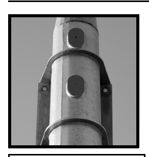
Where is This in Eagle Mountain? Photo Contest

With property values increasing by $30,000 to $40,000 in one year, Eagle Mountain is a good investment in the future in more ways than one.